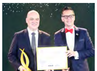
Best Mid End Condo Development (Davao) GRAND LAND, INC.