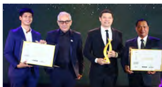
Best High End Condo Development (Davao) TORRE LORENZO DEVELOPMENT CORP.