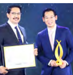
Best Office Development ARTHALAND CORP.