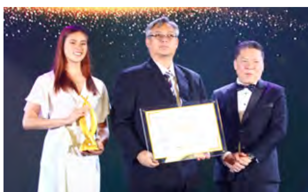
Best Mid Range Condo Development (Metro Manila) SM DEVELOPMENT CORP.