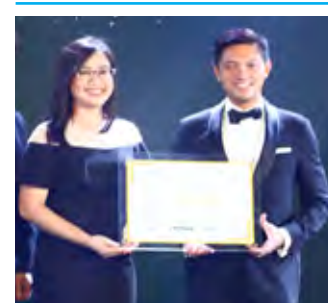
Best Office Architectural Design DAMOSIA LAND, INC.