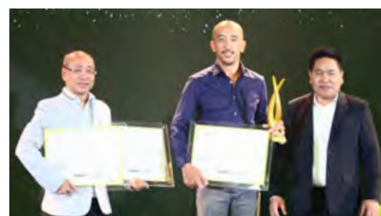
Best High End Condo Architectural Design ALVEO LAND