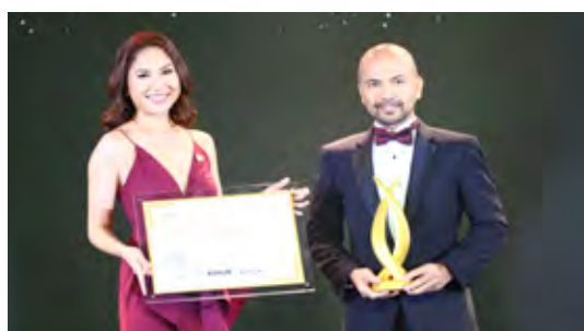
Best Luxury Condo Interior Design MEGAWORLD CORP.