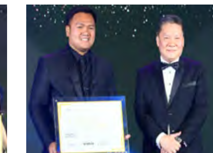
Best Universal Design Development EMPIRE EAST LAND HOLDINGS, INC.