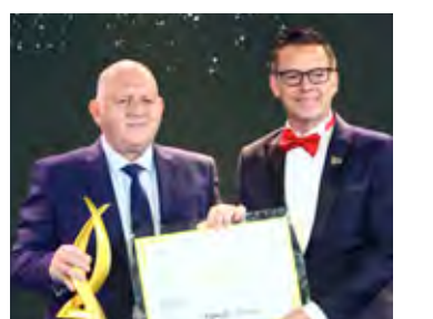
Best Retail Development MEGAWORLD CORP.