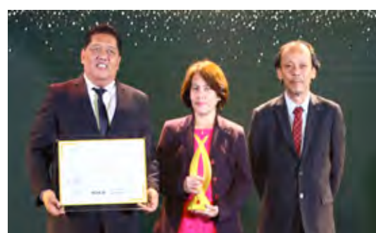
Best Commercial Landscape Architectural Design GLOBAL-ESTATE RESORTS, INC. (GERI)