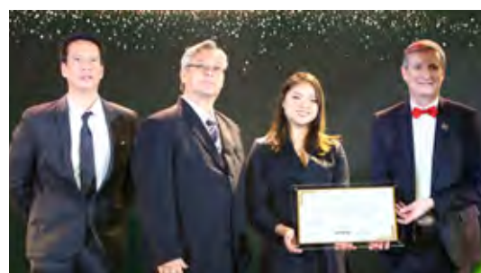
Best High End Condo Interior Design SM DEVELOPMENT CORP.