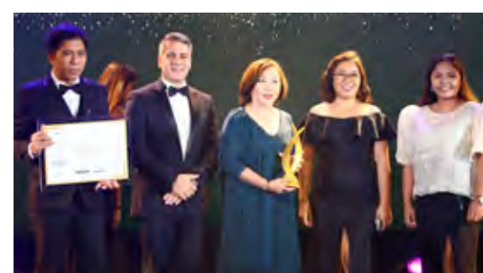
Special Recognition in Digital Innovation FIRECHECK BY THE UNIVERSITY OF THE PHILIPPINES CEBU AND DOST-PCIEERD

Special Recognition in Design and Construction ARTHALAND CORP.