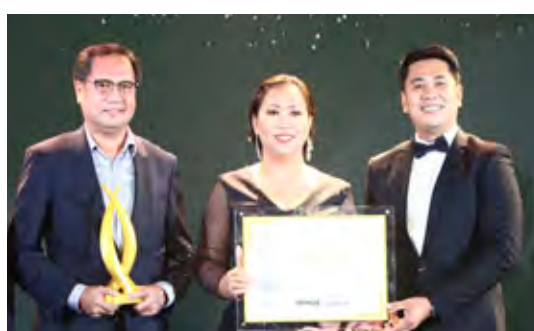
Best Condo Architectural Design (Cebu) ABC PRIME INC.