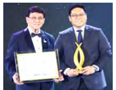
Best Mixed-Use Development MEGAWORLD CORP.