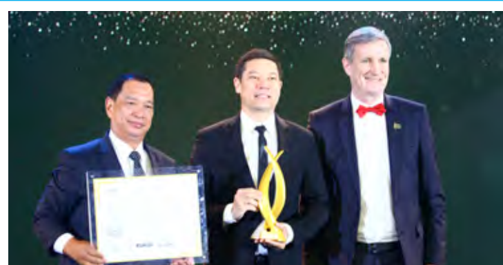
Best Boutique Developer TORRE LORENZO DEVELOPMENT CORP.