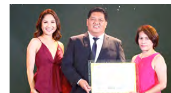
Best Housing Development (Philippines) GLOBAL-ESTATE RESORTS, INC. (GERI)