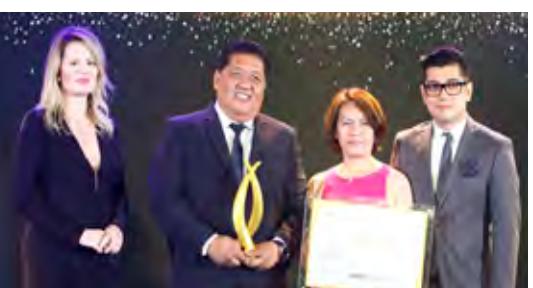
Best Housing Development (Resort Destination) GLOBAL-ESTATE RESORTS, INC. (GERI)