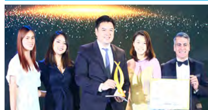
Philippines Real Estate Personality of the Year HENRY SY, SR. AND FAMILY, SM INVESTMENTS CORP.