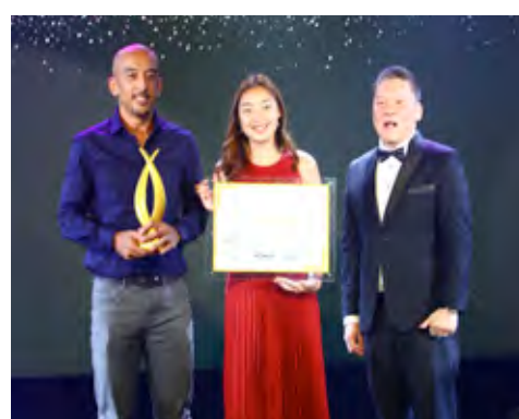
Best High End Condo Development (Metro Manila) ALVEO LAND