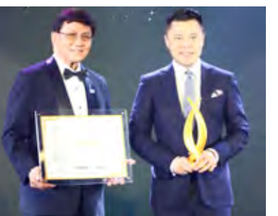
Best Township Development MEGAWORLD CORP.