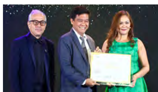
Best High End Condo Development (Cebu) CEBU LANDMASTERS, INC.