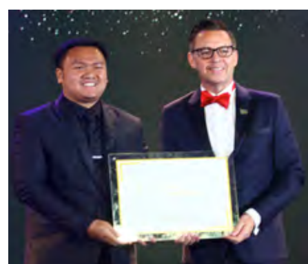
Best Mid End Condo Development (Metro Manila) EMPIRE EAST LAND HOLDINGS, INC.