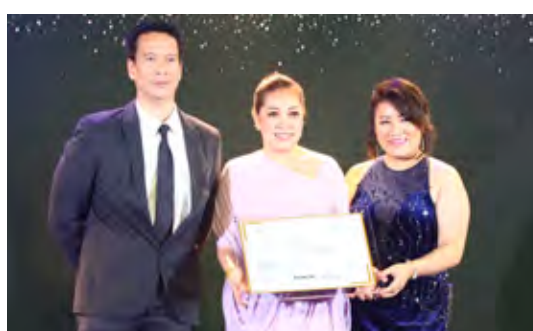
Best Condo Landscape Architectural Design SM DEVELOPMENT CORP.