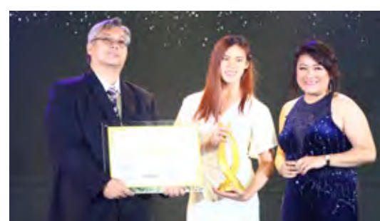
Best Condo Development (Greater Manila) SM DEVELOPMENT CORP.