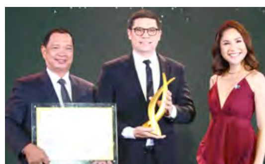
Best Hotel Interior Design TORRE LORENZO DEVELOPMENT CORP.