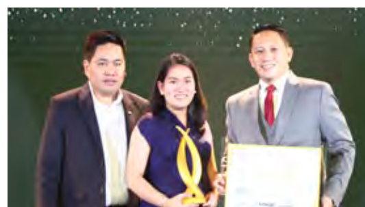
Best Mid End Condo Interior Design ROBINSONS LAND CORP.