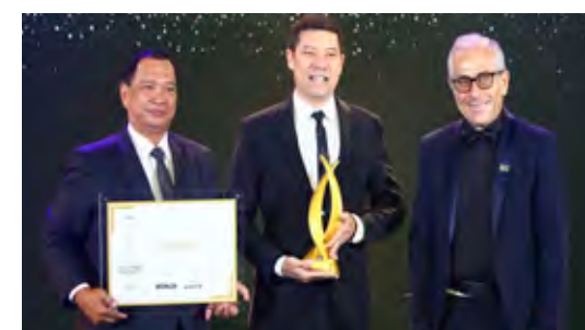
Best Condo Development (Philippines) TORRE LORENZO DEVELOPMENT CORP.