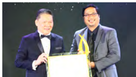
Best BPO Office Development MEGAWORLD CORP.