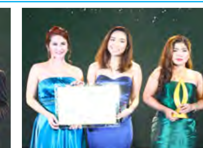
Best Co-working Space SPACES