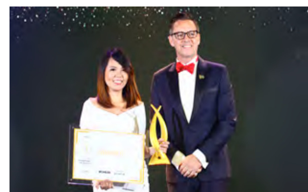
Best High Rise Affordable Condo Development (Metro Manila) EMPIRE EAST LAND HOLDINGS, INC.