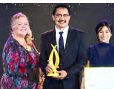
Best Green Development ARTHALAND CORP.