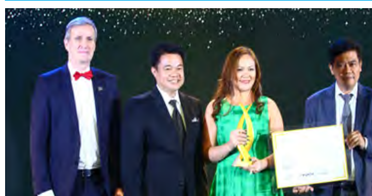
Best Developer CEBU LANDMASTERS, INC.