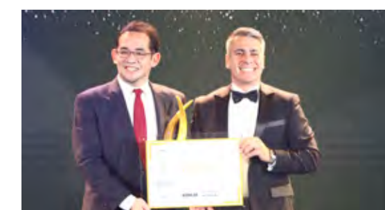
Special Recognition for Public Facility PARAÑAQUE INTEGRATED TERMINAL EXCHANGE (PITX), MWM TERMINALS INC.