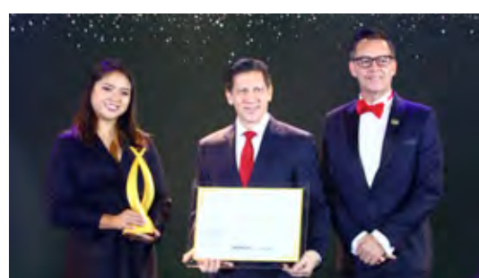
Best Low Rise Affordable Condo Development (Metro Manila): SM DEVELOPMENT CORP.